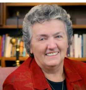
Guest Speaker: Sr. Joan Chittister